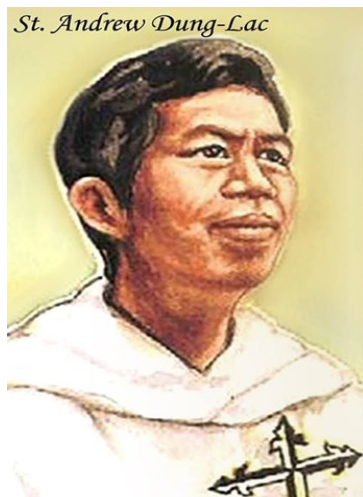
St. Andrew Dung-Lac

ENTRANCE ANTIPHON: May we never boast, except in the Cross of our Lord Jesus Christ. For the word of the Cross is the power of God to us who have been saved.